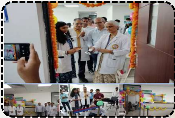
Inauguration of TCC