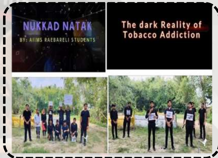
Tobacco Related Outreach Activity