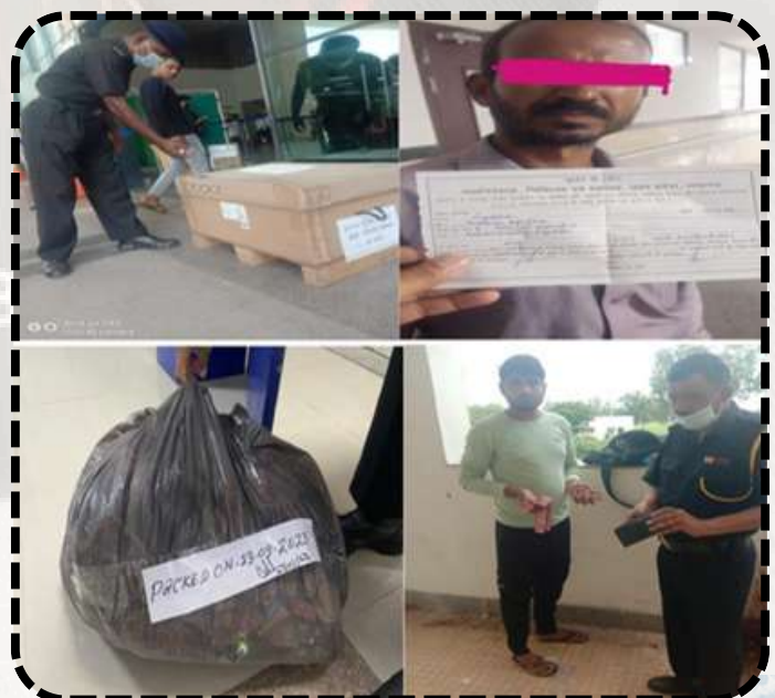
Steps toward Tobacco Free AIIMS Campus